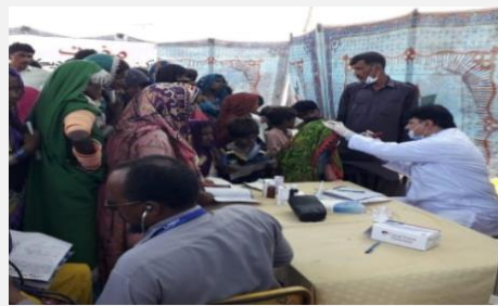
Free Medical Camp treating 215 patients treated at Goth Karachi, 170 patients.