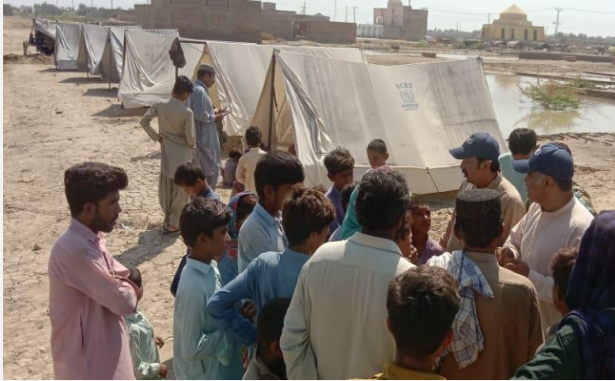
Establishment of Tent Villages at Jafferabad Balochistan