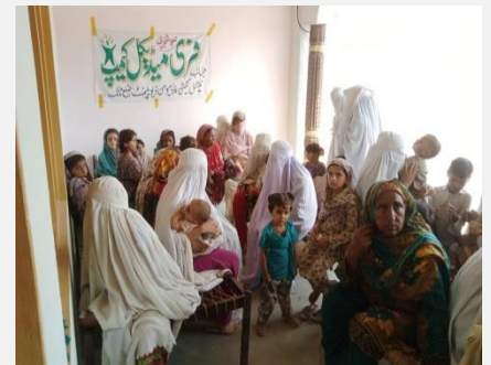
Free medical camp treating 390 at village Gara Mithu, Tank 16 Sep