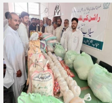
NCHD Volunteers involved in rescue operations in Rajanpur, 1 st September