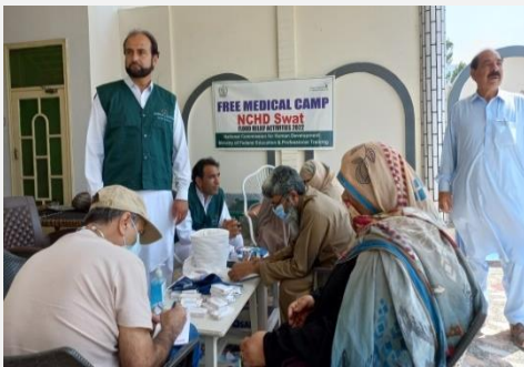
300 Patients examined in free Medical camp at Swat; 14 Sep

The effected population in KPK is exposed to high levels of food insecurity, water borne diseases and risks of COVID-19 infections as a majority are accommodated in evacuation shelters that are crowded with limited hygiene materials to use. KPK teams are focusing more on medical facilities and have mobilized medicines worth of Rs. 4.2 million from different philanthropists and pharmaceutical companies for the purpose of relief. NCHD team organized 21 medical camps in different districts and 8,621 patients were treated