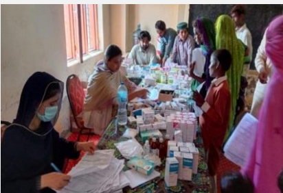
Free Medical Camp at Sanghar; 3 rd Sep, 2022.

An outbreak of contagious diseases has surfaced in flood-hit areas; most of the cases are being reported from the flood-ravaged areas of Sindh including skin allergies, chest infection and diarrhea. On 12th September, 10,802 cases of the diarrhea, 11,190 cases of chest infection, and 16,107 cases of skin infection have been reported from Sindh. NCHD arranged 56 free medical camps in 15 districts of Sindh, 18, 696 patients have been examined and provided free medicine. Medicines mobilized by NCHD team are worth of Rs. 1,762,700/- A free vaccination camp for livestock was also organized in Tando Muhammad Khan.