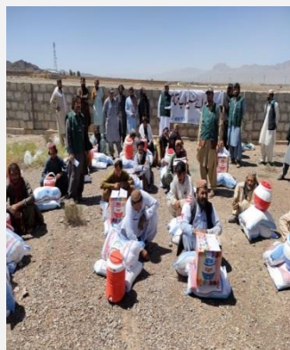
NFIs and FIs were distributed in Qilla Saifullah (9 th September)