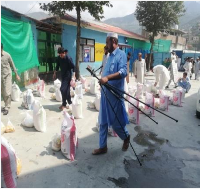
NCHD Distributed Food Items among Flood affected people in Lower Dir (11 th September.