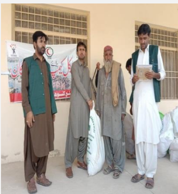
Ration Bags were distributed in Kohlu (8 th September)

Under Emergency Response project an amount of Rs. 4,500,000 were allocated for 18 districts of Balochistan by the NCHD/PHDF. Ration bags were distributed among 1,040 families and cooked food was provided to 5,535 individuals in flood hit areas of Baluchistan. Drinking water was contaminated due to flood and it became a major reason for diseases like diarrhea and gastro NCHD handed over 7,910 bottles of mineral water and 40 tankers in Baluchistan. Among the non-food Items 302 tents, 1800 utensils (sets) and 177 blankets were disseminated to the flood affectees.