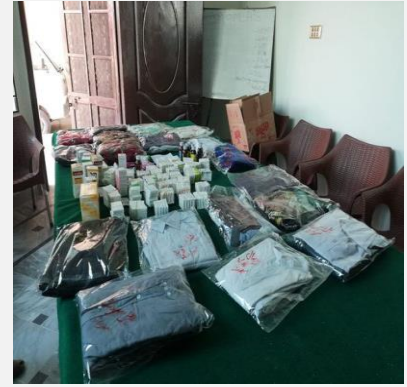
Collection of grocery for flood affected families, Bhakar.