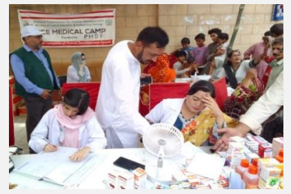
Free medical camp at IDPs camp GGS sachal at village Hayat Khashely, Badin.