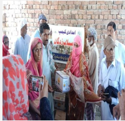
Distribution of Ration Bags in Dera Ghazi Khan by NCHD Muzaffargarh.