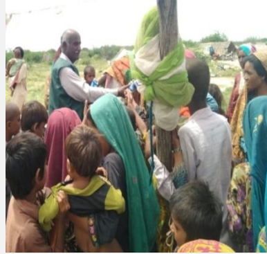
Distribution of Ration Bags, Jamshoro (1 st September)