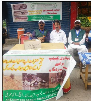
Collection point organized by Kahuta Team.