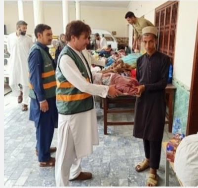
Ration Bags and Cloths Distribution in Nowshera (12 th September)