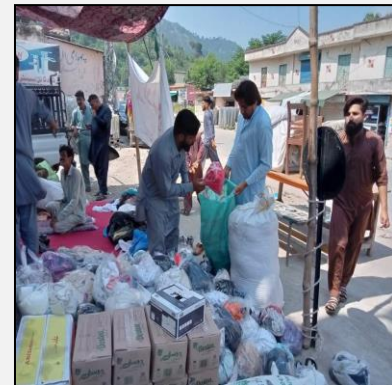
Relief Camp at Kotli by NCHD.

In view of the above apart from the projects in collaboration with PHDF, a brief summary of the activities carried out by NCHD provincial offices through its Human Development Support Units (HDSUs) across the country have put every effort to provide relief to the flood affected communities through fund raising from individual philanthropists, NGOs, INGOs and other relief organizations including I-CARE international in KP. The funds were raised both in cash and kind. The table below depicts the contribution of NCHD during the Flash Flood 2022.