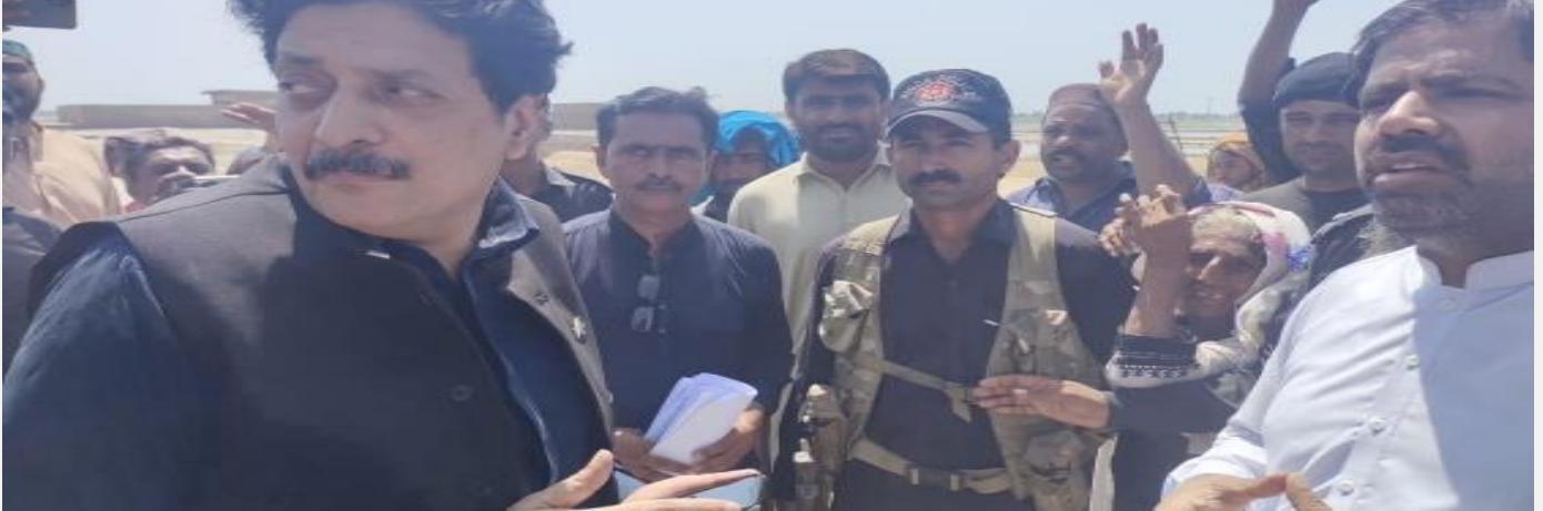
Honorable Judge Visit to NCHD Camp at Kashmore