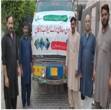
Truck carrying food & non-food items and medicines departed from Bahawalpur to Rajanpur.