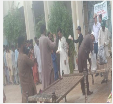
Cooked food distributed among flood victims, Hyderabad (2 nd September)

NCHD Sindh established different collection points, relief camps, visited a number of shopping centers and philanthropists to contribute in the relief activities. Hence, Sindh team successfully collected an amount of Rs. 917,000/- in cash. NCHD staff also volunteered their services to IDPs in different tent cities arranged by other organizations for rescue and relief activities.