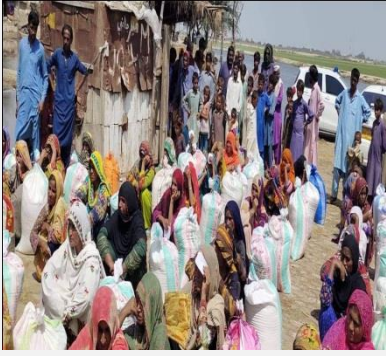
Ration Bags distribution Kashmore; 30th Aug