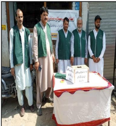
Relief Camp by Bagh Team.

NCHD teams in AJK organized relief camps/ collection points all over AJK in order to support the flood affectees across the country.