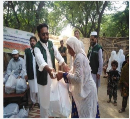
RationBags and Water Bottles Distribution in Village Haji Mora, D. I. Khan (13 th September)