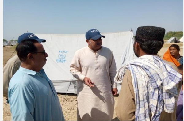
DO Balochistan meeting with the flood affected community