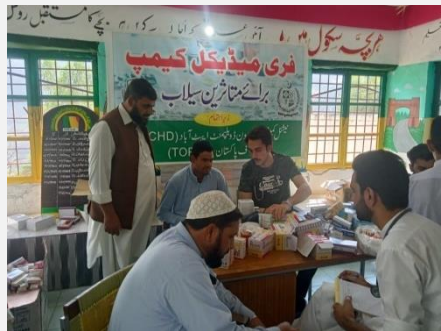
Medical Camp organized by NCHD in Abbotabad, 15 th September