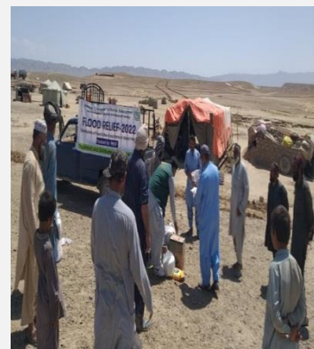
Distribution of food items & water bottles in Pishin (10 th September)