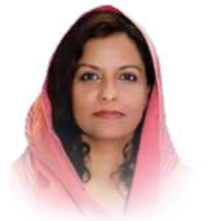
Chairperson NCHD Miss Nafisa Shah

"NCHD is the lead agency for literacy in Pakistan, which has been recognized by UNESCO. This national forum needs our combined efforts. I ensure full support of my government to this national body and urge the provincial governments work out a coordinated mechanism for ensuring universal literacy in minimum possible time."