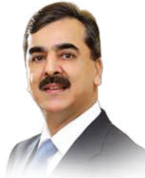
Honorable Prime Minister of Pakistan Syed Yousaf Raza Gillani

"I urge the educational planners adopt multi-pronged strategy for the eradication of illiteracy and provision of education to all: children, youth, and adults. To ensure that, I propose the formation of a high level National Literacy Council convened by the Prime Minister and include Chief Ministers, Federal and Provincial Ministers for Education, Finance and Planning as its members."