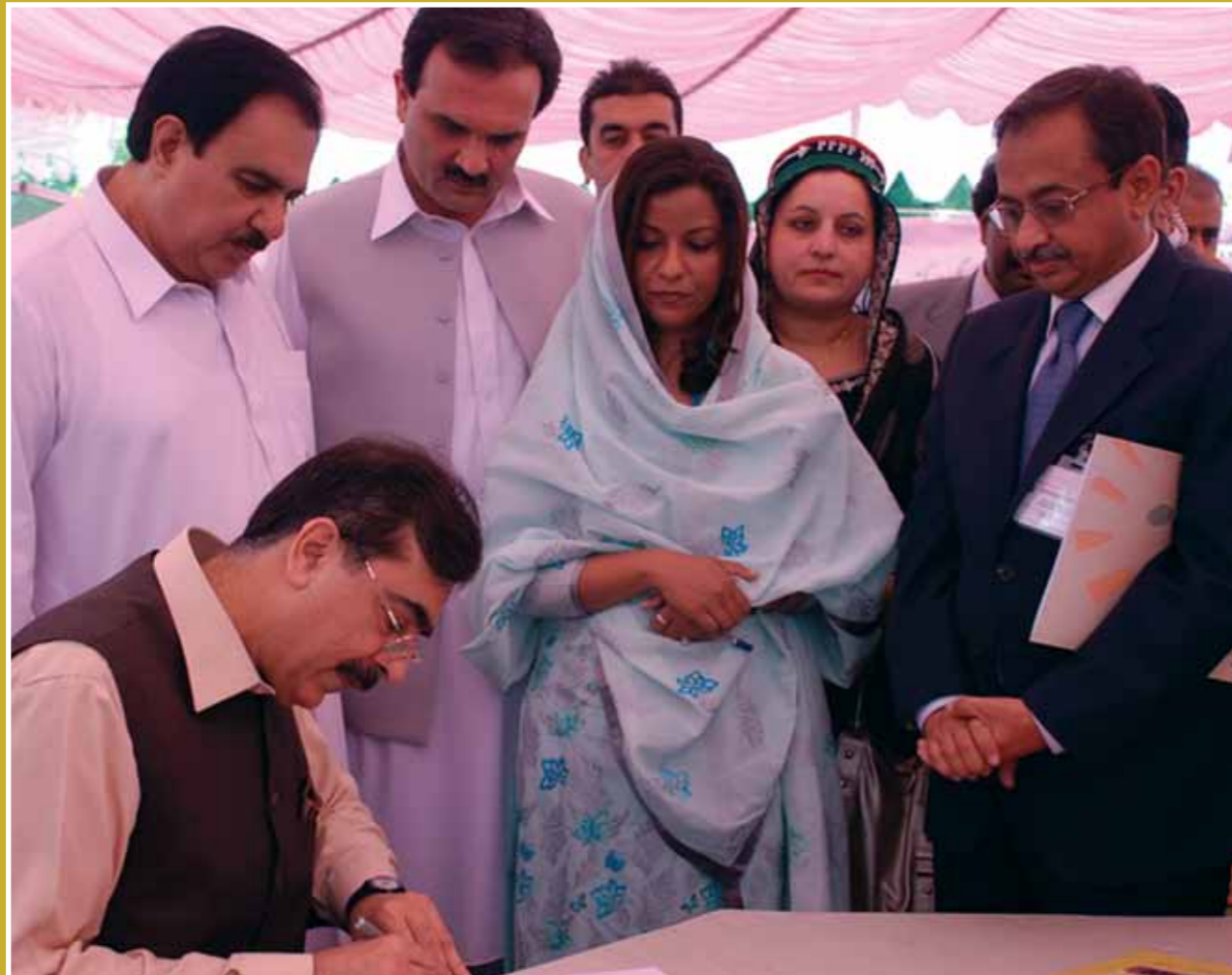
The honorable Prime Minister of Pakistan Syed Yousaf Raza Gillani launched NCHD's Literacy Program for 2009-12 on September 8, 2009 in Peshawar.