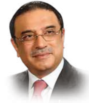
Honorable President of Pakistan Asif Ali Zardari

"I urge the educational planners adopt multi-pronged strategy for the eradication of illiteracy and provision of education to all: children, youth, and adults. To ensure that, I propose the formation of a high level National Literacy Council convened by the Prime Minister and include Chief Ministers, Federal and Provincial Ministers for Education, Finance and Planning as its members."